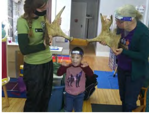
A Head Start student learning while having a bit of fun!

SEVCA's Windsor County Head Start program recently received exceptional results from its Focus Area 1 (FA1) federal review. This review process, conducted by the Administration for Children and Families (ACF) and the Office of Head Start (OHS), assesses both program performance and compliance with school readiness requirements. After a comprehensive assessment, which included on-site monitoring, the reviewers found SEVCA's Head Start program to be in full compliance, with no deficiencies. The report highlighted some of the program's many successes, including: a partnership with a homeless shelter to respond to the community's homelessness crisis; a pen pal system with local kindergartners to innovatively aid children in their transition to elementary school; a thoughtful approach to improving children's health outcomes, particularly as they relate to COVID-19; and connecting families with various food resources and programs to support their well-being.